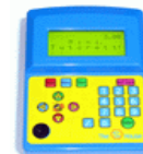
Tutorett & Mini Tutorett